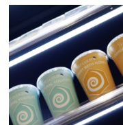
LED light under each shelf